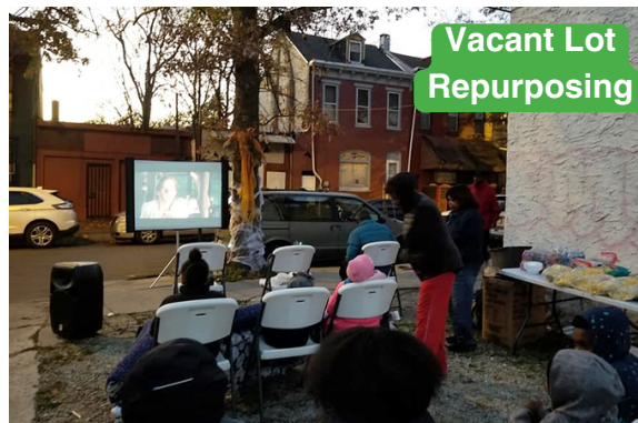
Vacant Lot Repurposing